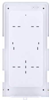
Size 2 (accessories not included)