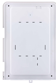
Size 4 (accessories not included)